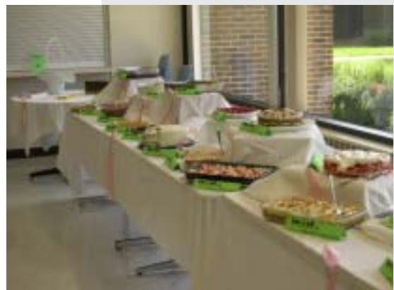
21 desserts helped Local 17 raise $358 for Breast Cancer from their 3 campuses.

Kohler Spa Gift Certificate Country Crafts Gift Certificate UW Badger Hockey Tickets Food & Beverage Gifts plus MORE!