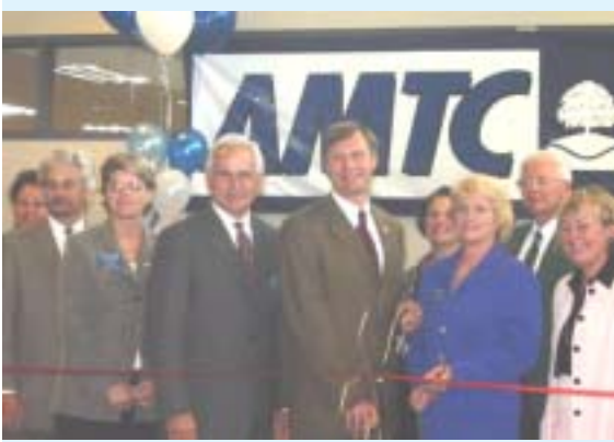
Gov. McCallum attends ceremony